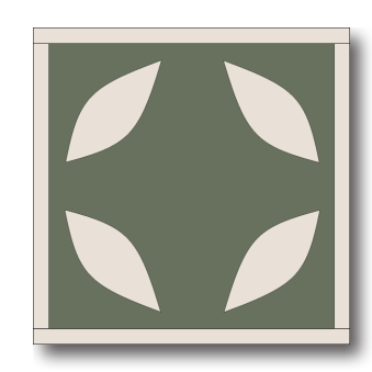
Jane Stickle Colorway