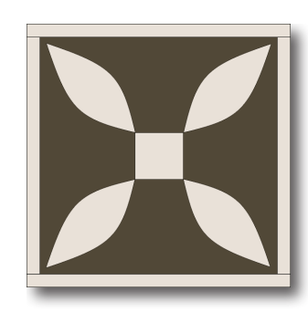
Jane Stickle Colorway