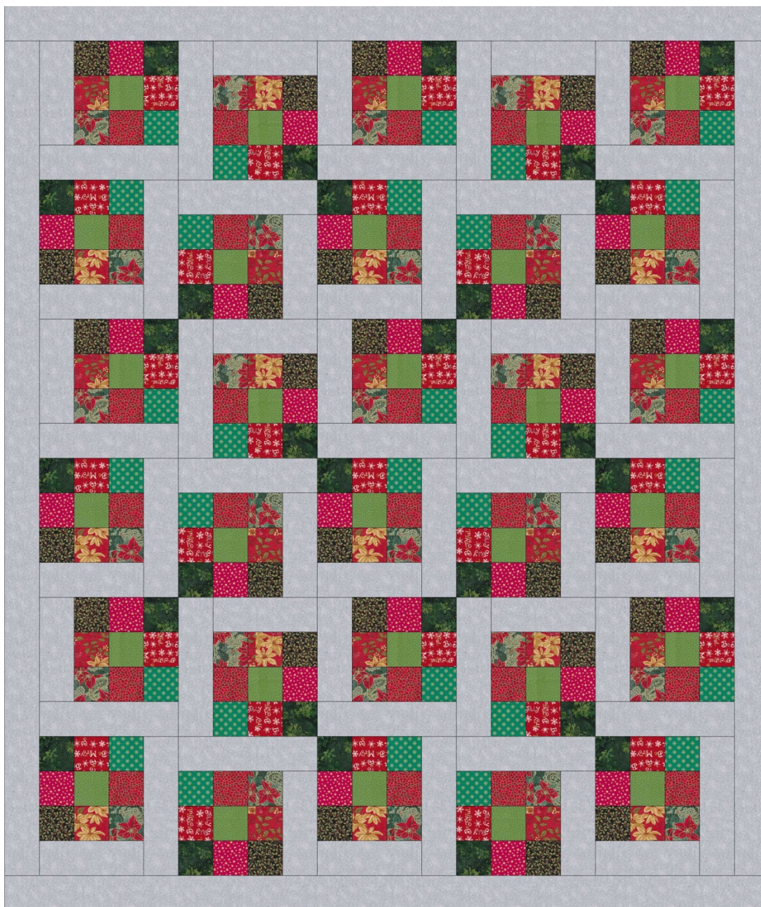
Figure 4: Layout

For the border, piece together strips to make 2 border strips 72½ inches long. Piece together the remaining strips to make 2 border strips 66½ inches long. Sew the 72½ inch strips to left and right sides of the quilt top. Sew the 66½ inch strips to the remaining top and bottom sides.