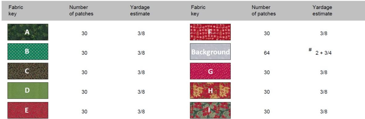
Figure 1: Fabric

# The estimate for this fabric assumes that long strips ARE pieced.