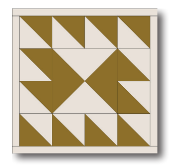
Jane Stickle Colorway

*The actual required width for Unit A and Unit B units is ¾". The increased width specified above allows for squaring the block to exactly 5½".